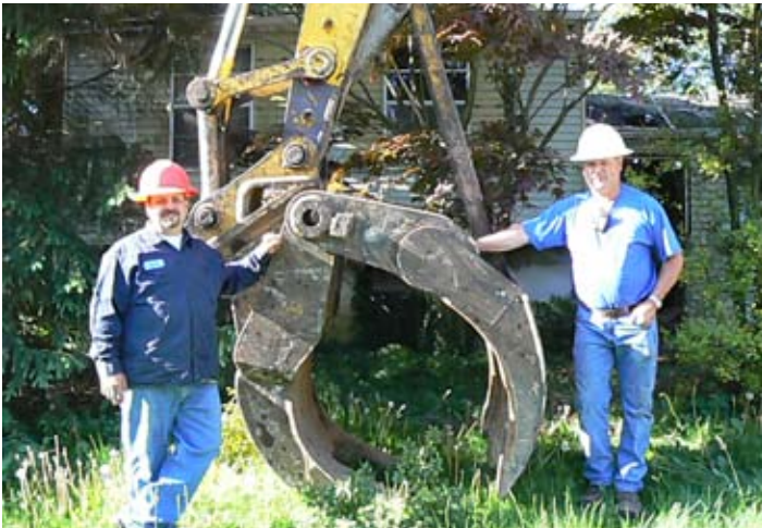
3545 Makassar House Before Demolition