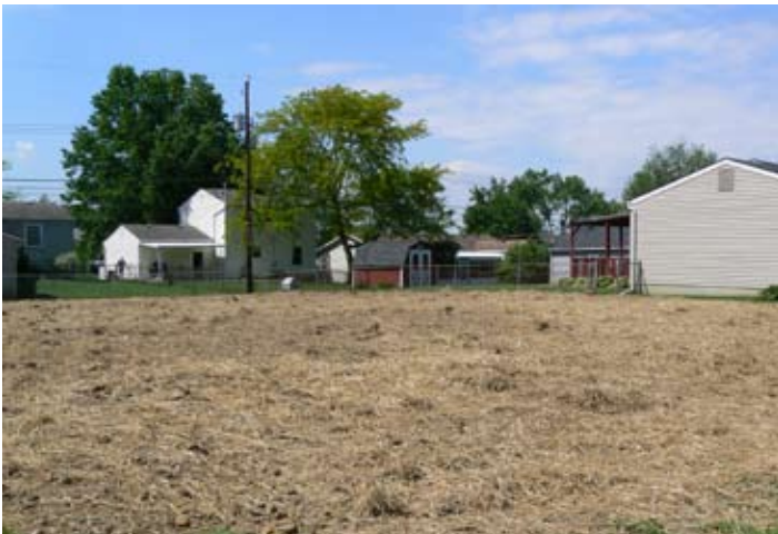
... and Afterwards