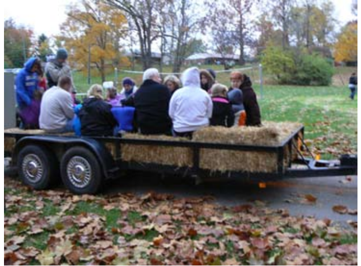
Riding on the Hay Wagon