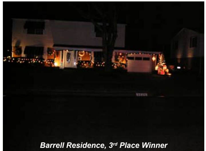
Barrell Residence, 3 rd Place Winner