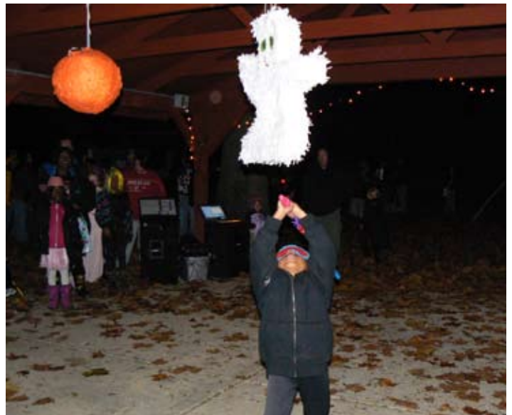
Hitting the Ghostly Piñata