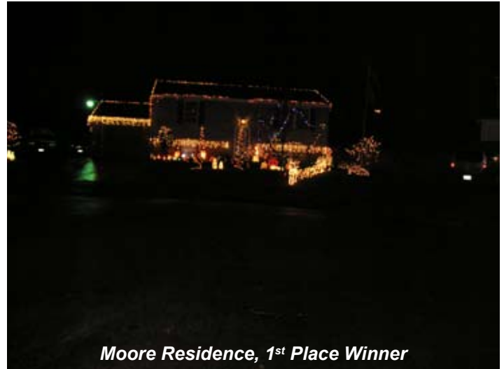
Moore Residence, 1 st Place Winner

Holiday Lights and Decorations Contest Coordinator