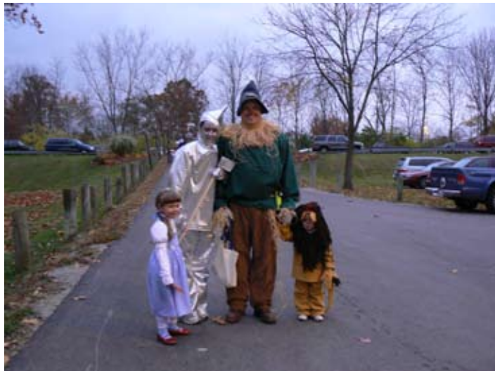
Approaching the Registration Table