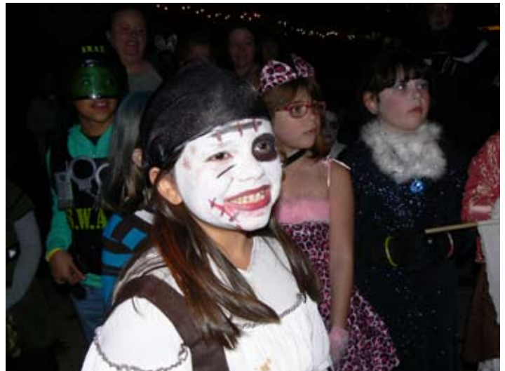
Entering the Costume Contest