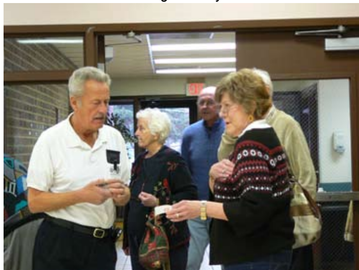
Residents Registering and Putting on Name Tags