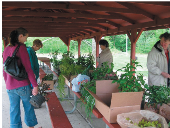
Neighbors peruse the wide variety of plants at a previous plant swap.

KW GREATER COLUMBUS KELLERWILLIAMS. REALTY