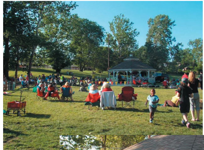
Scenes from the first Concert in the Park